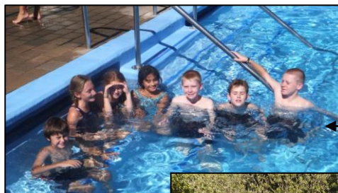
Relaxing in the hot pools after a big day at the Hurunui Triathlon

Please telephone Stevie on 0276762922 to register.